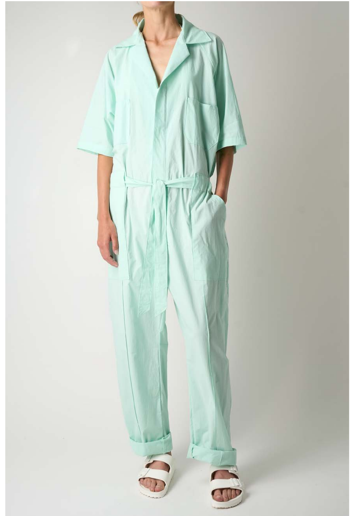
#8 APRES BEACH JUMPSUIT