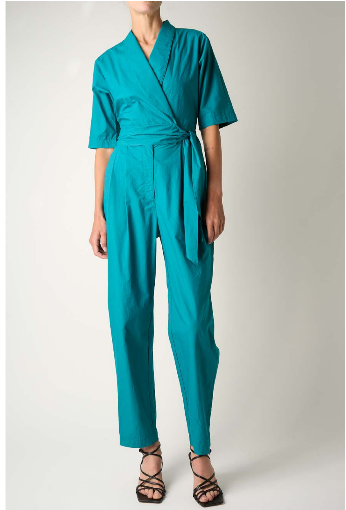
#20 ERLA JUMPSUIT