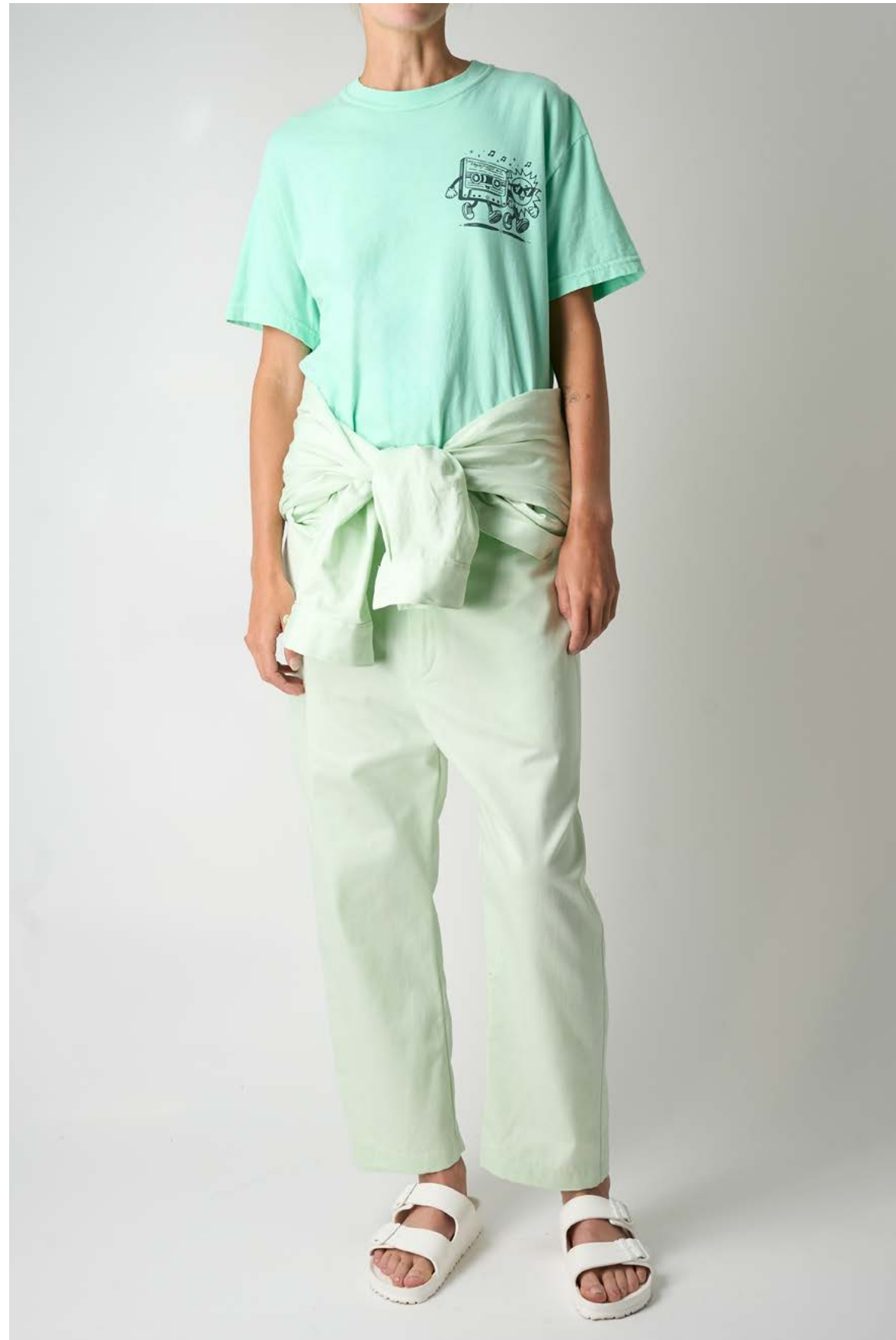
#9 MIXTAPES TEE | SARAH JUMPSUIT