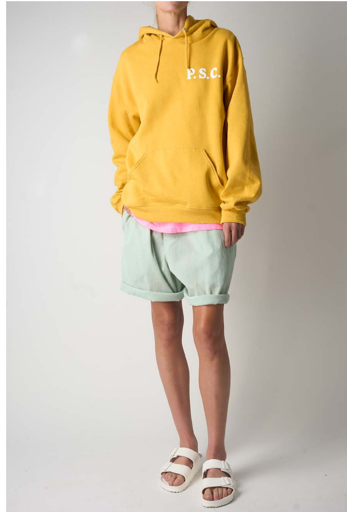
#6 SUN CLUB HOODIE | EMIL SHORTS