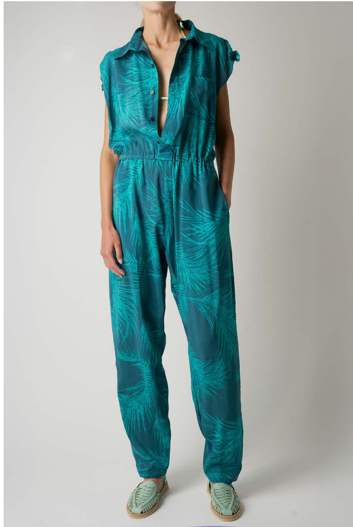
#25 KNOT JUMPSUIT