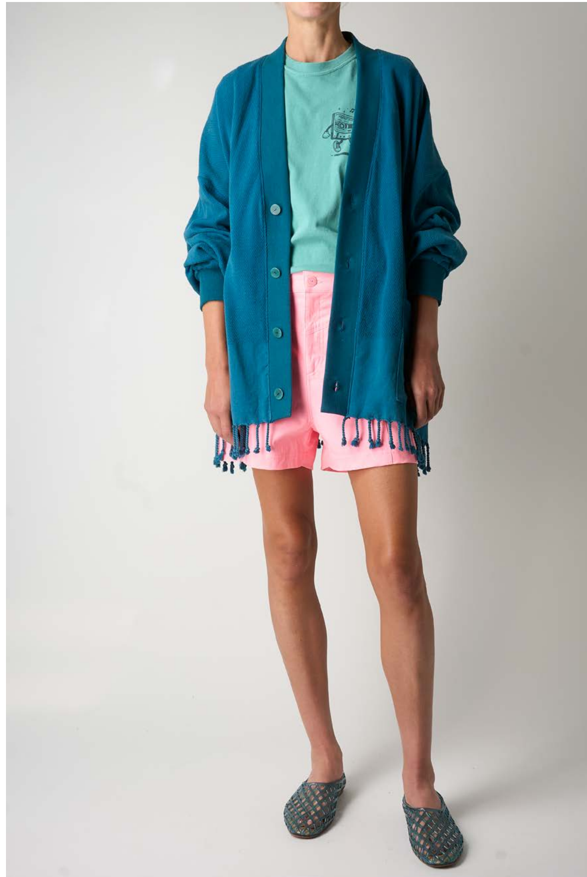
#23 BEACH CARDIGAN | MIXTAPES TEE | LARA SHORTS