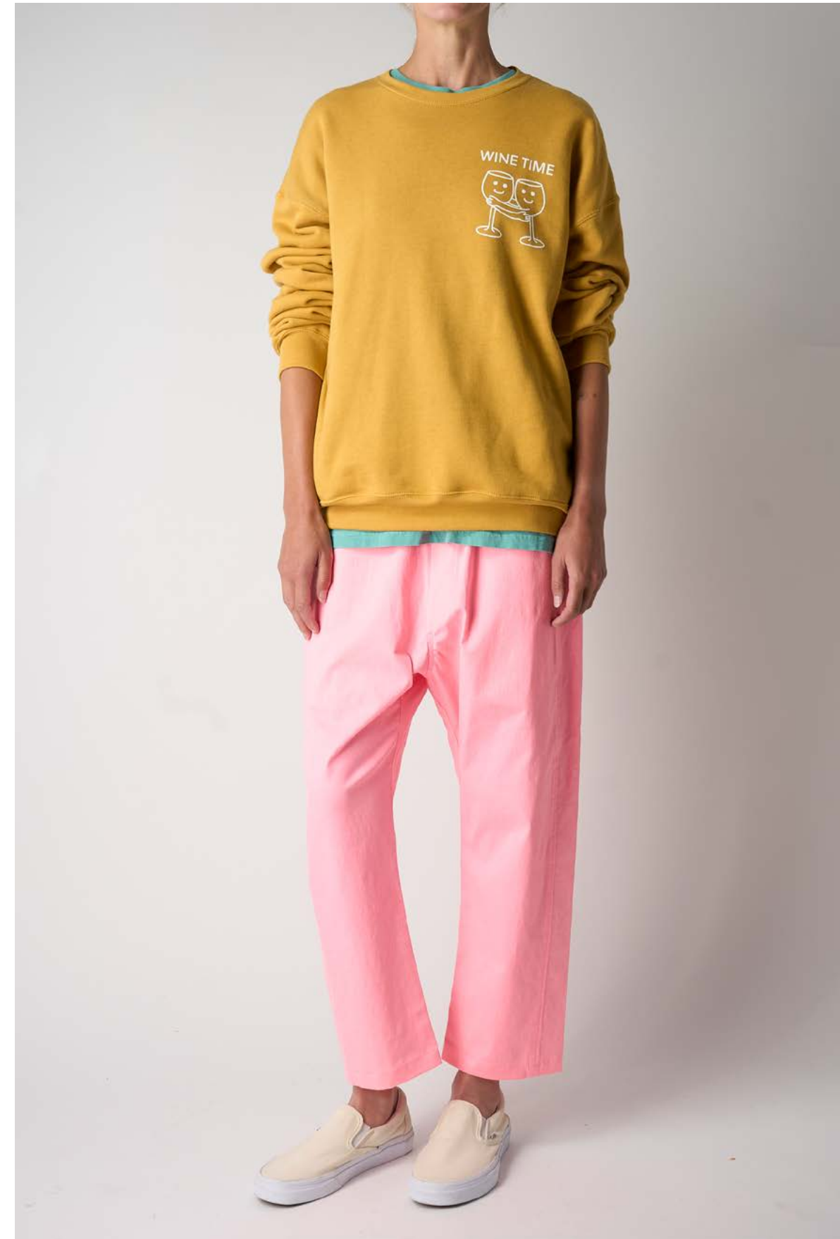
#10 WINE TIME CREW | UMI PANTS