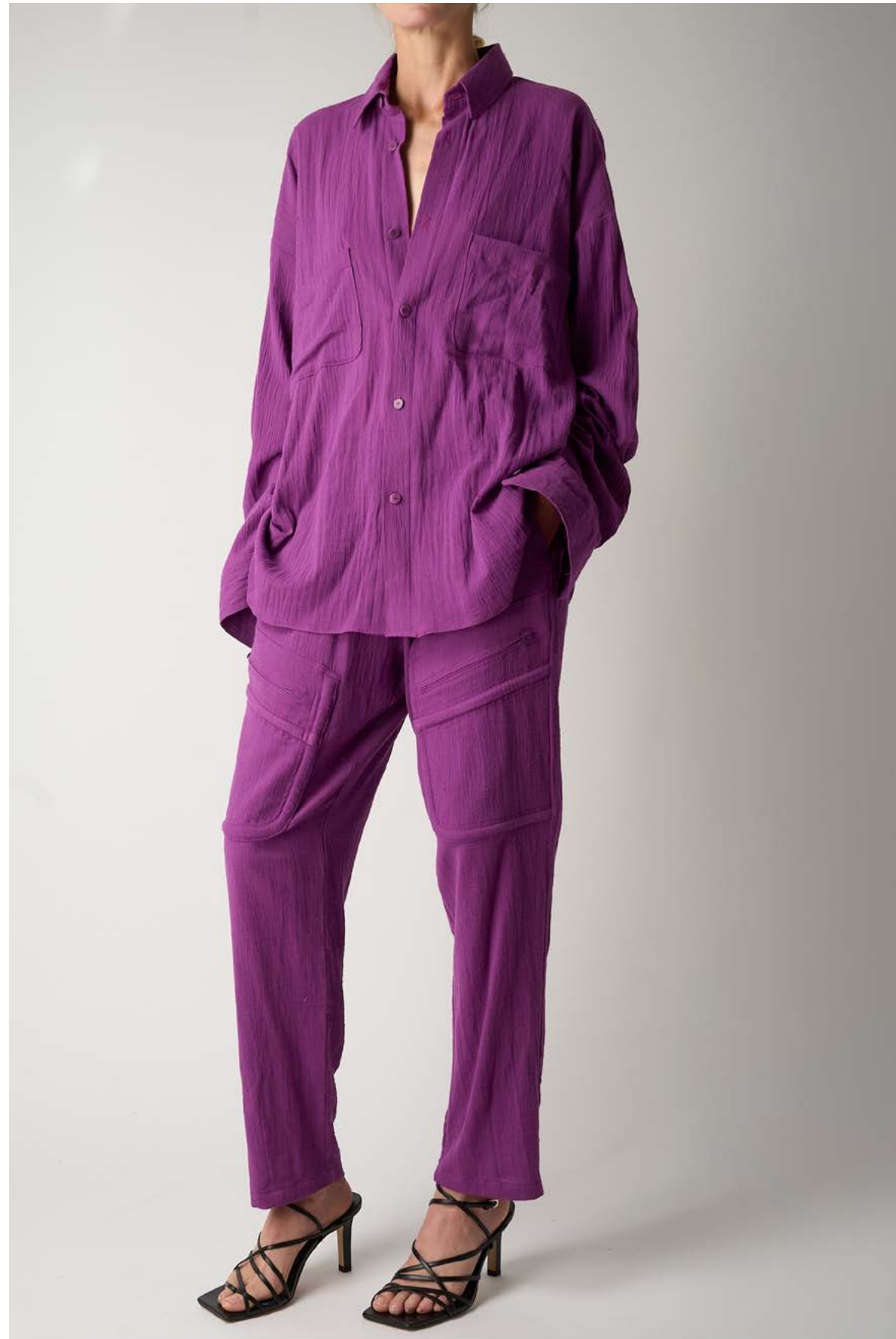
#17 STEVE SHIRT | OTTO PANTS