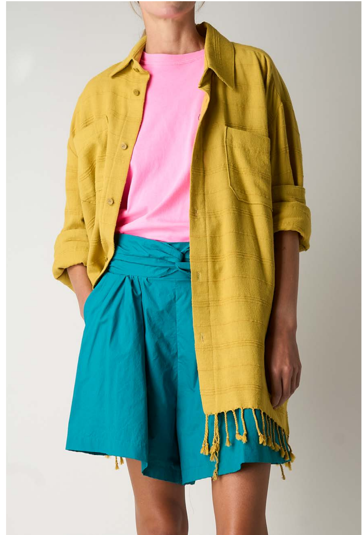
#14 MATT SHIRT | SUN CLUB TEE | ABBEY SHORTS