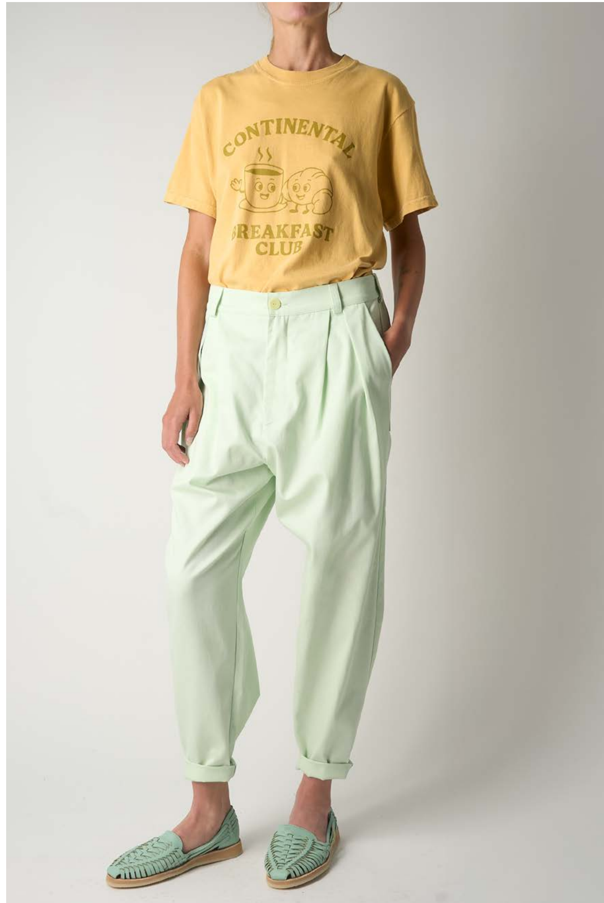
#3 CONTINENTAL BREAKFAST TEE | TOBIAS PANTS