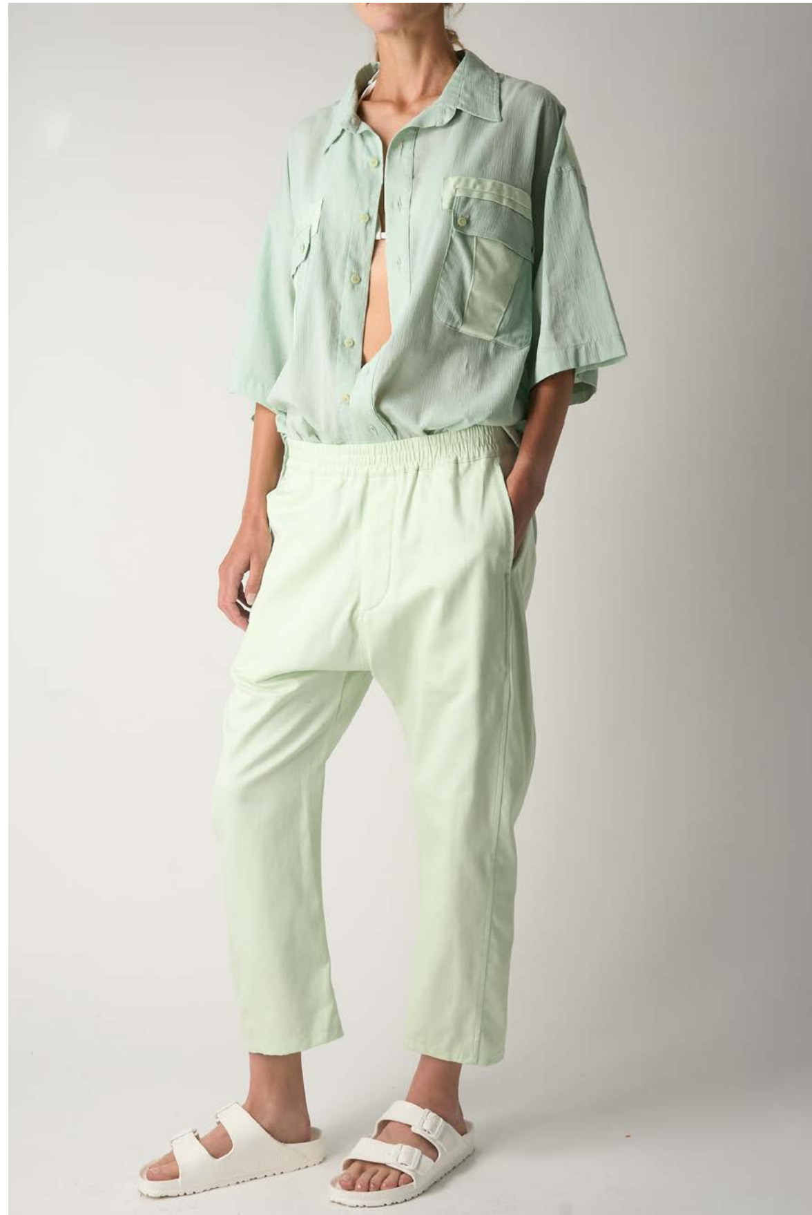
#7 SHEPARD SHIRT | UMI PANTS