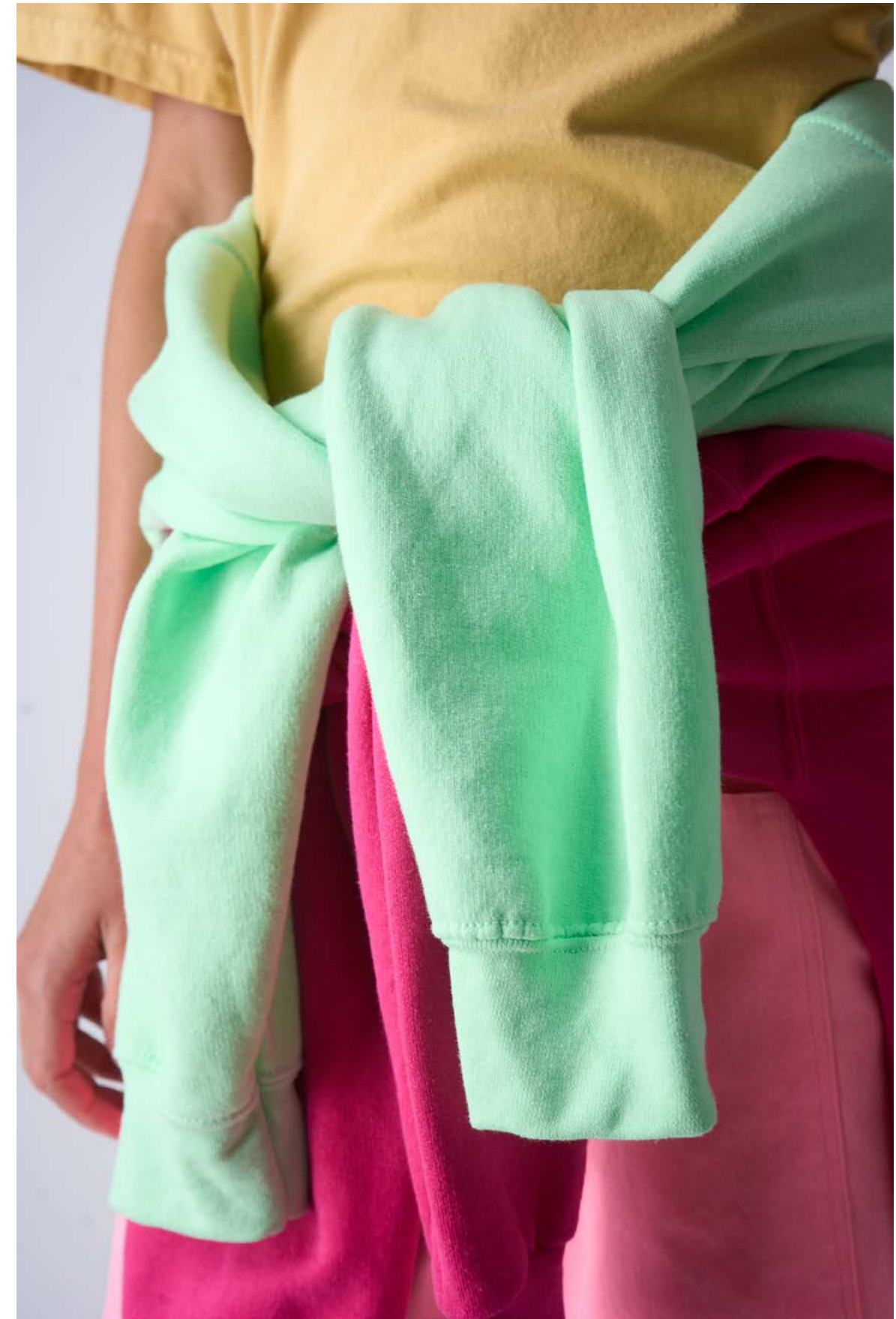
#12 WINE TIME TEE | SUN CLUB HOODIE | WINE TIME CREW | LARA SHORTS