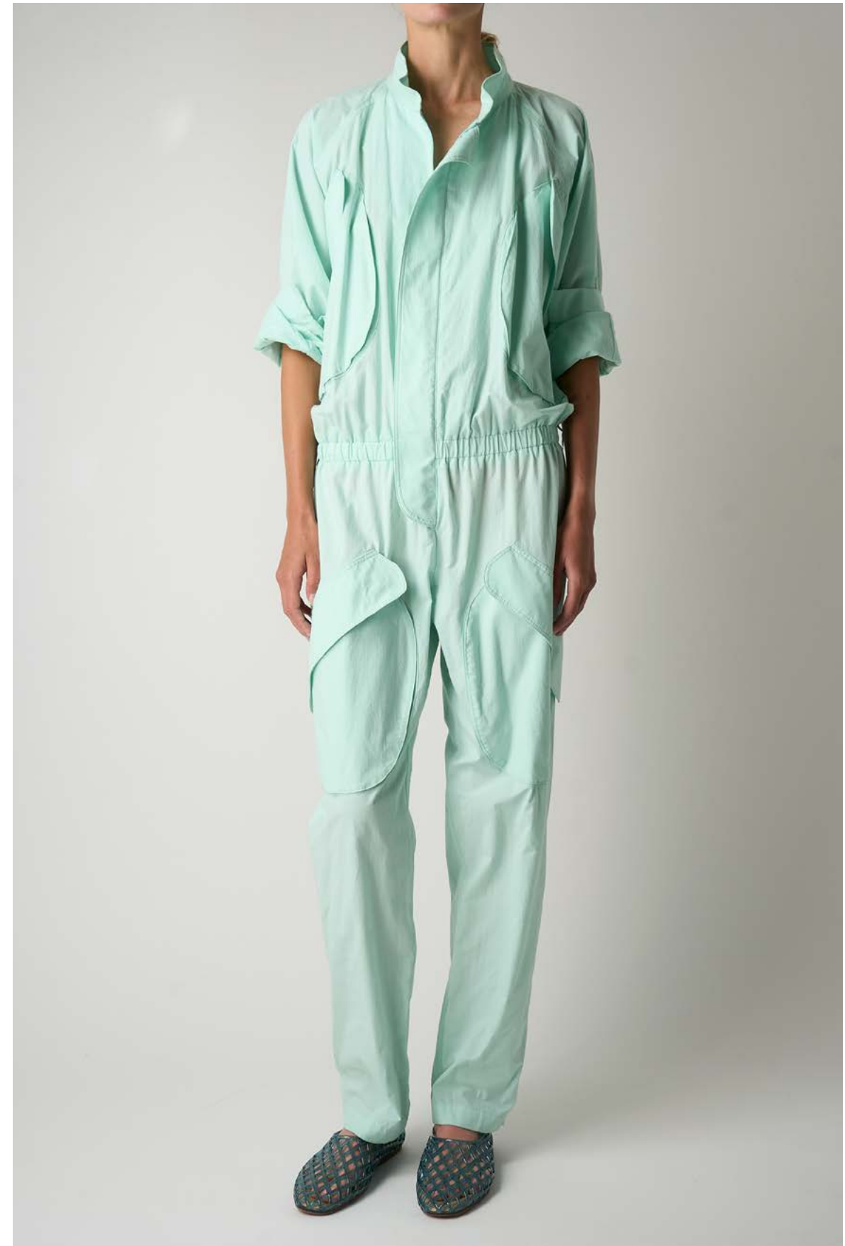
#4 FLIGHT SUIT