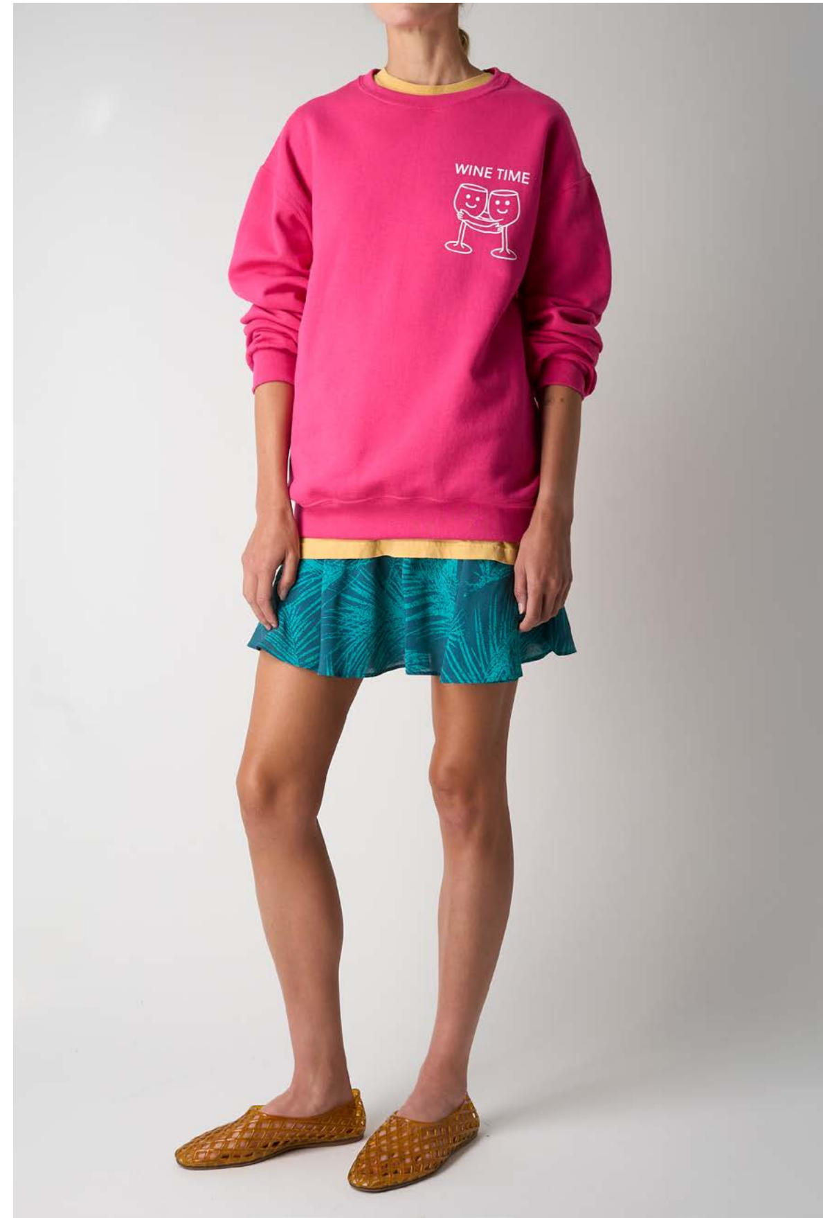
#26 WINE TIME CREW | LENI SKIRT