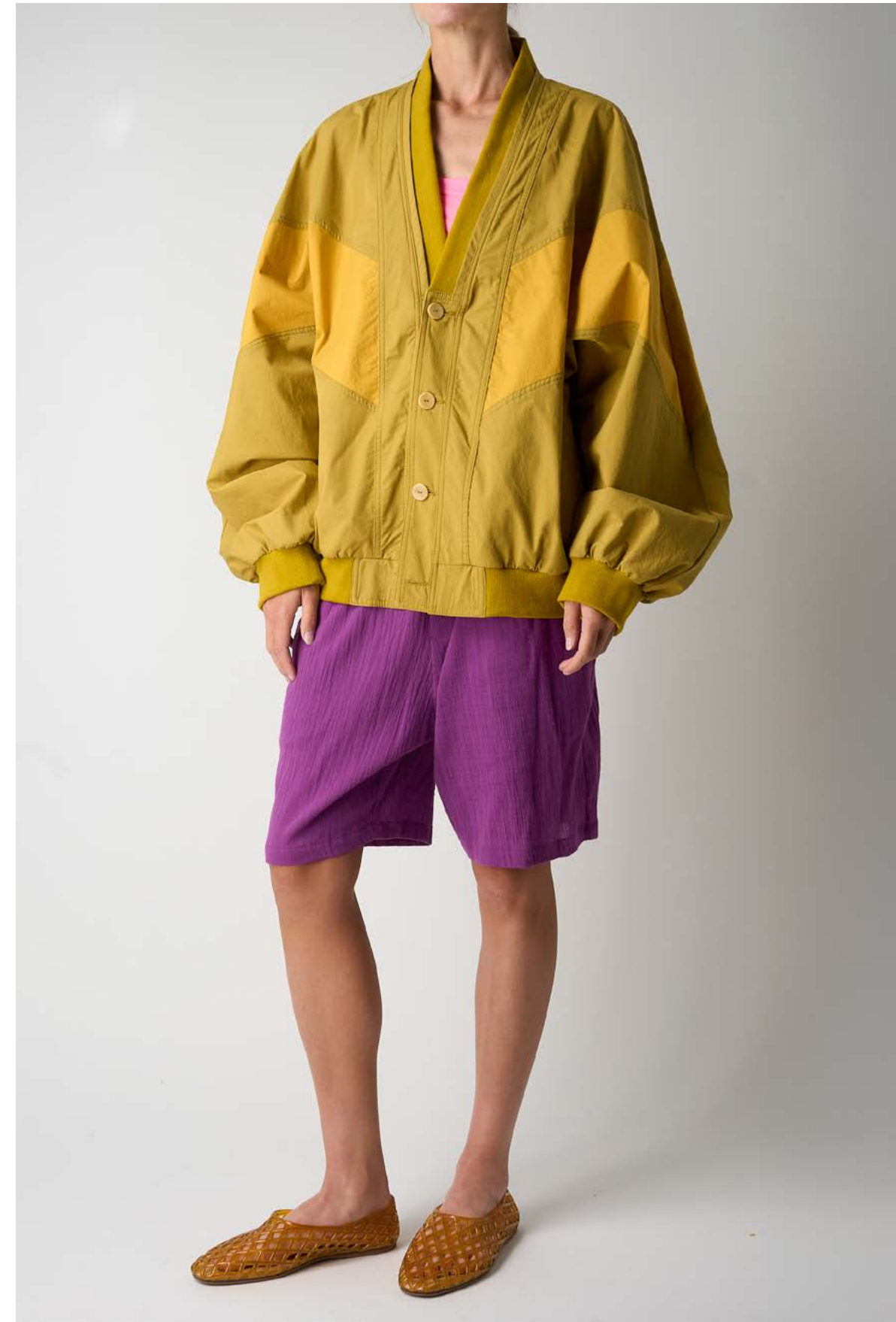
#16 BEACH BLOUSON | EMIL SHORTS