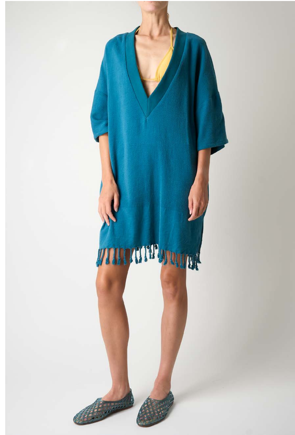
#22 RUBY KAFTAN