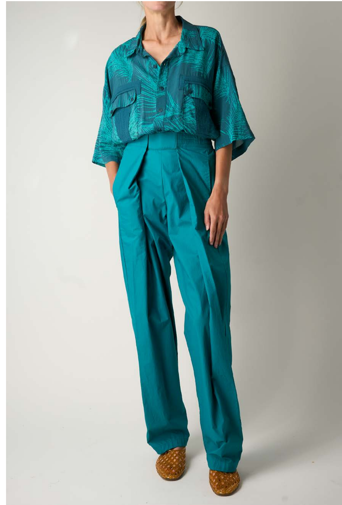
#24 SHEPARD SHIRT | SURF PANTS