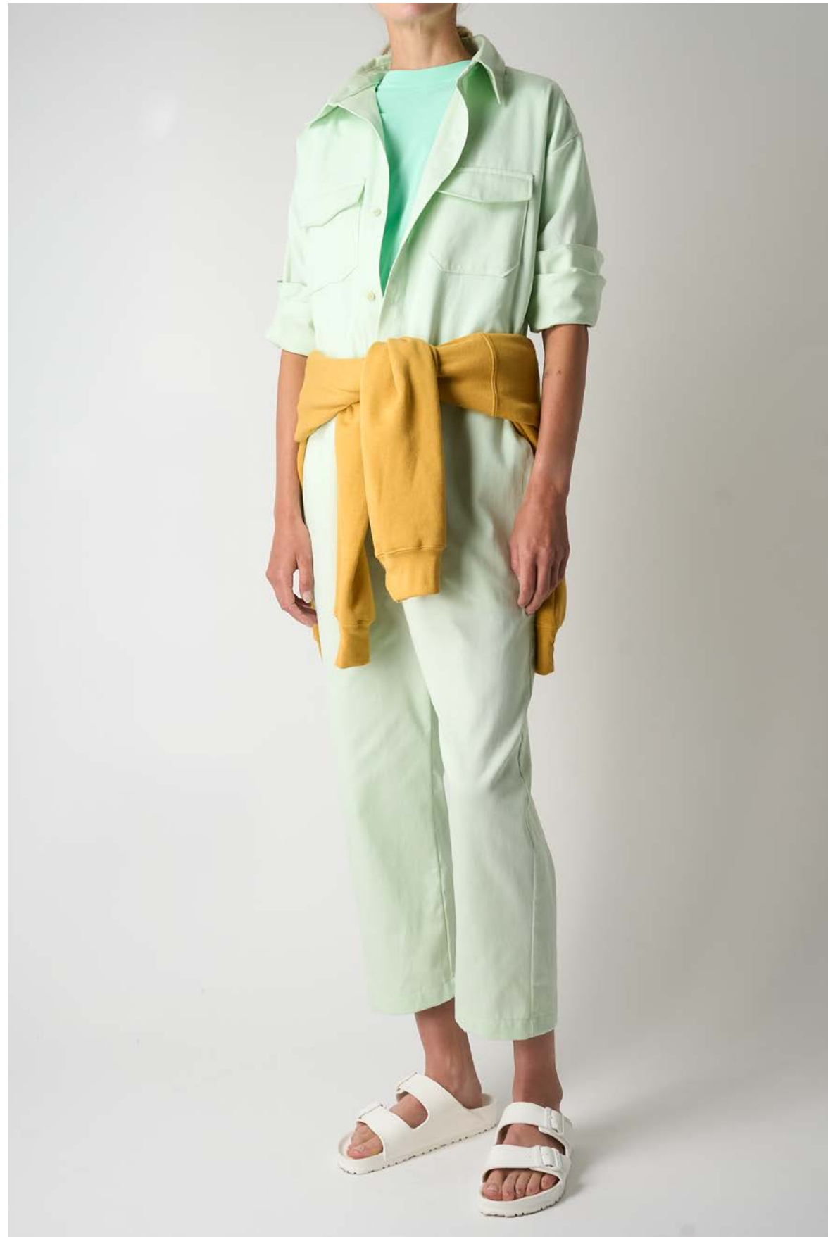
#1 SARAH JUMPSUIT | MIXTAPES TEE