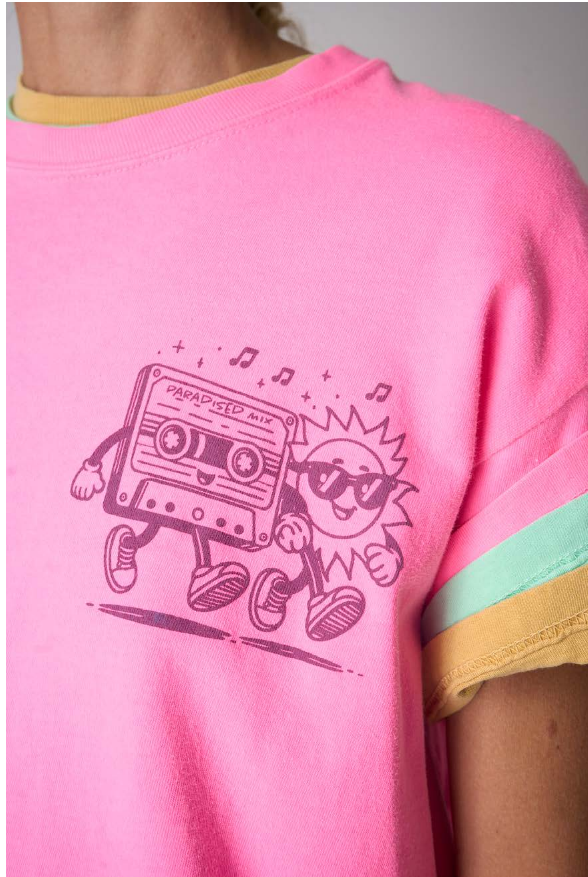
#29 MIXTAPES TEE