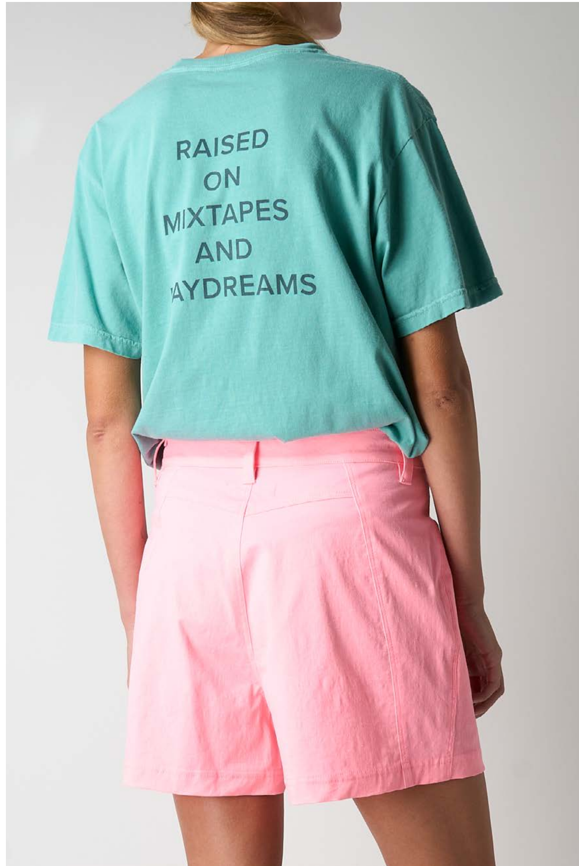
#15 MIXTAPES TEE | LARA SHORTS