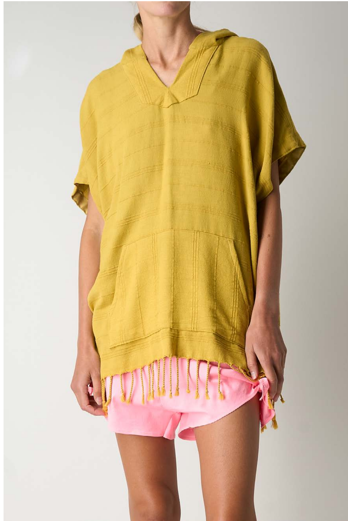
#11 SLEEVELESS BAJA | KNOT SHORTS