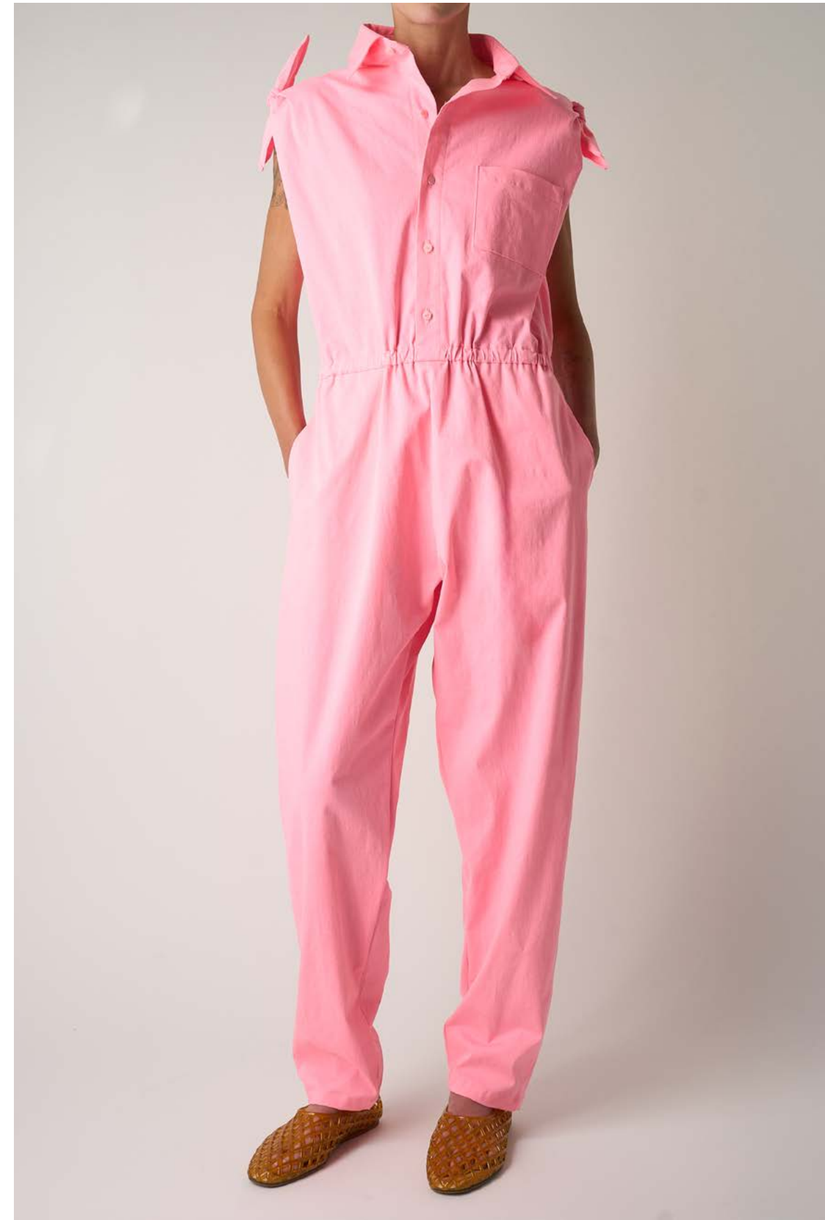
#30 KNOT JUMPSUIT