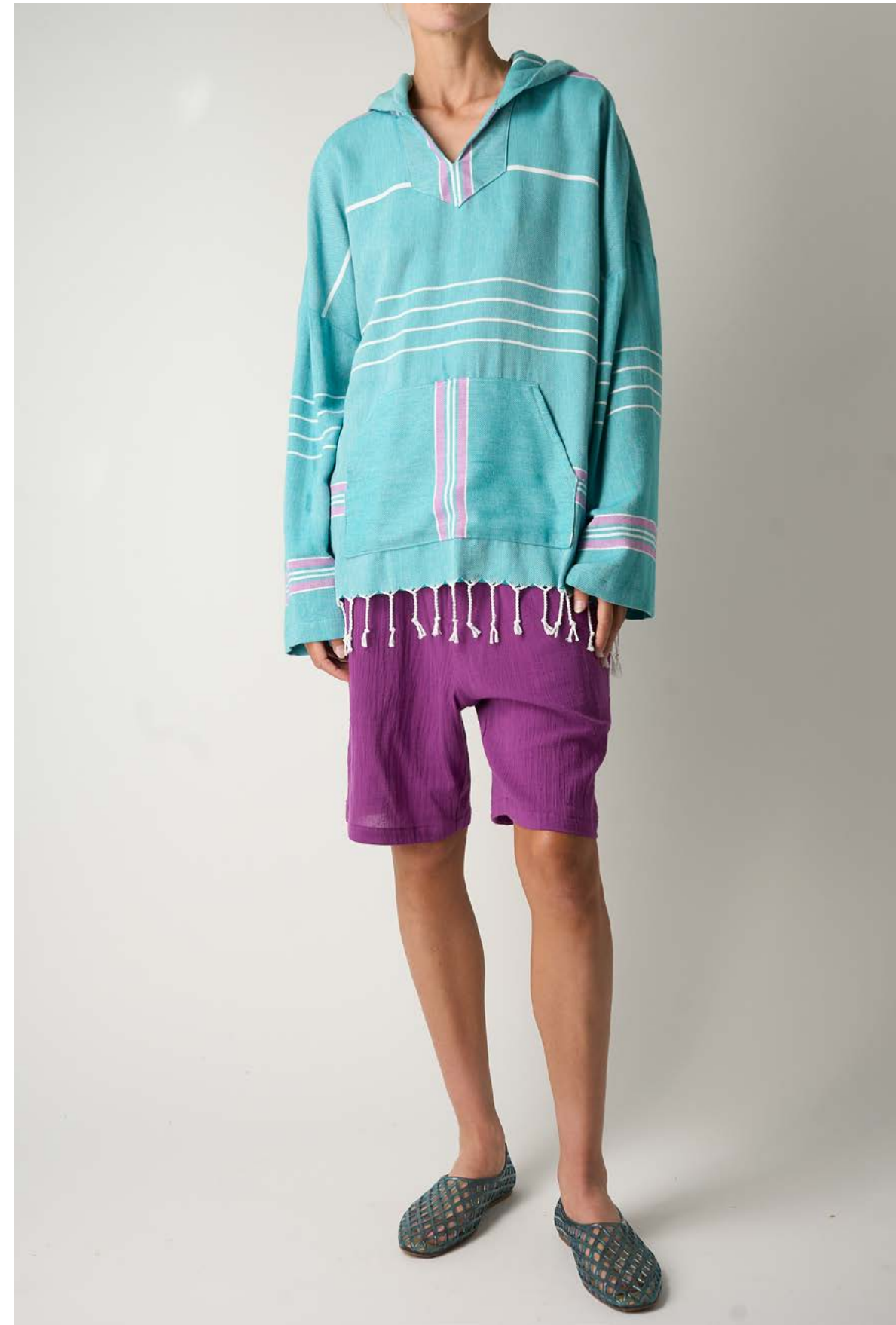
#18 BAJA HOODIE | EMIL SHORTS