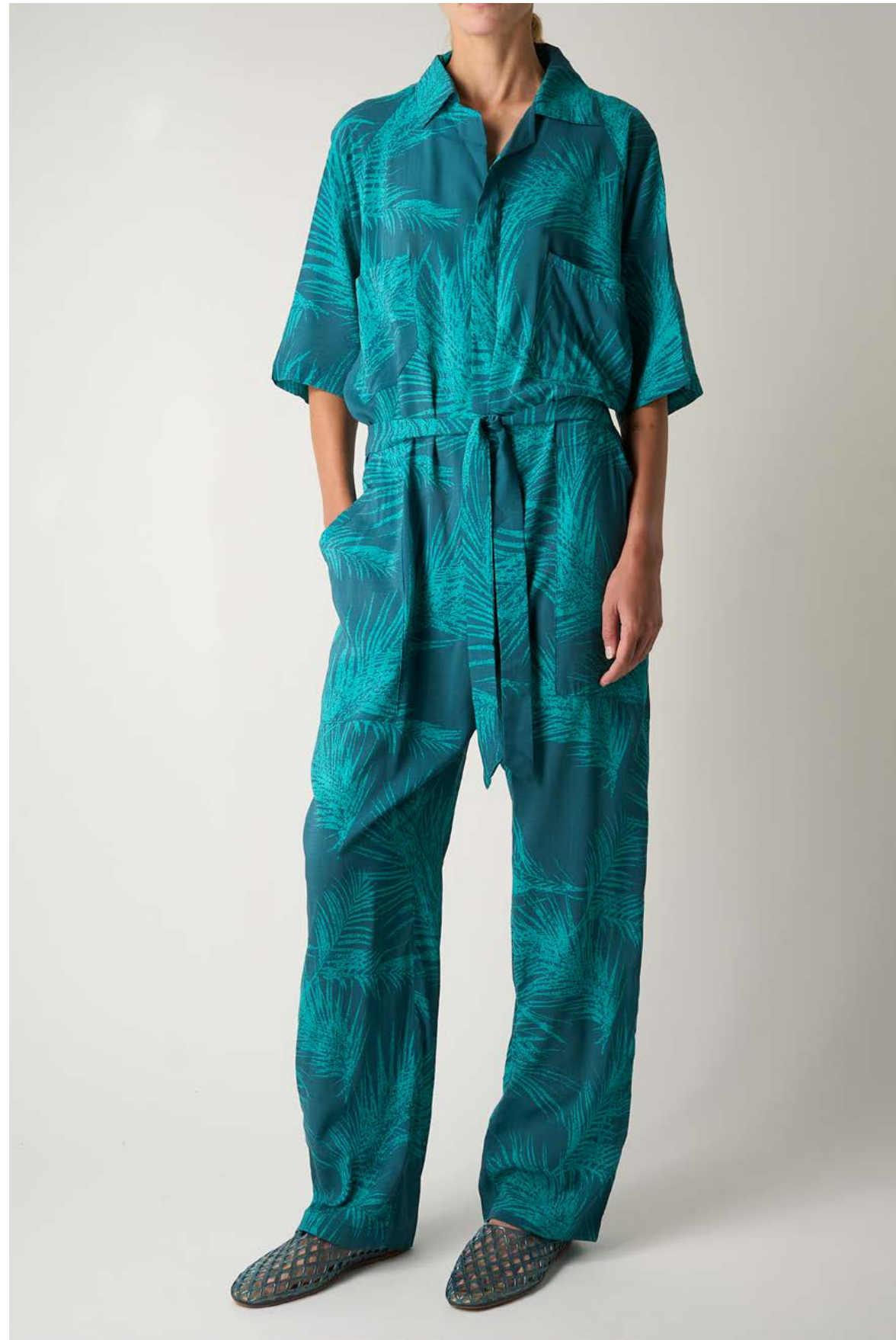
#21 APRES BEACH JUMPSUIT