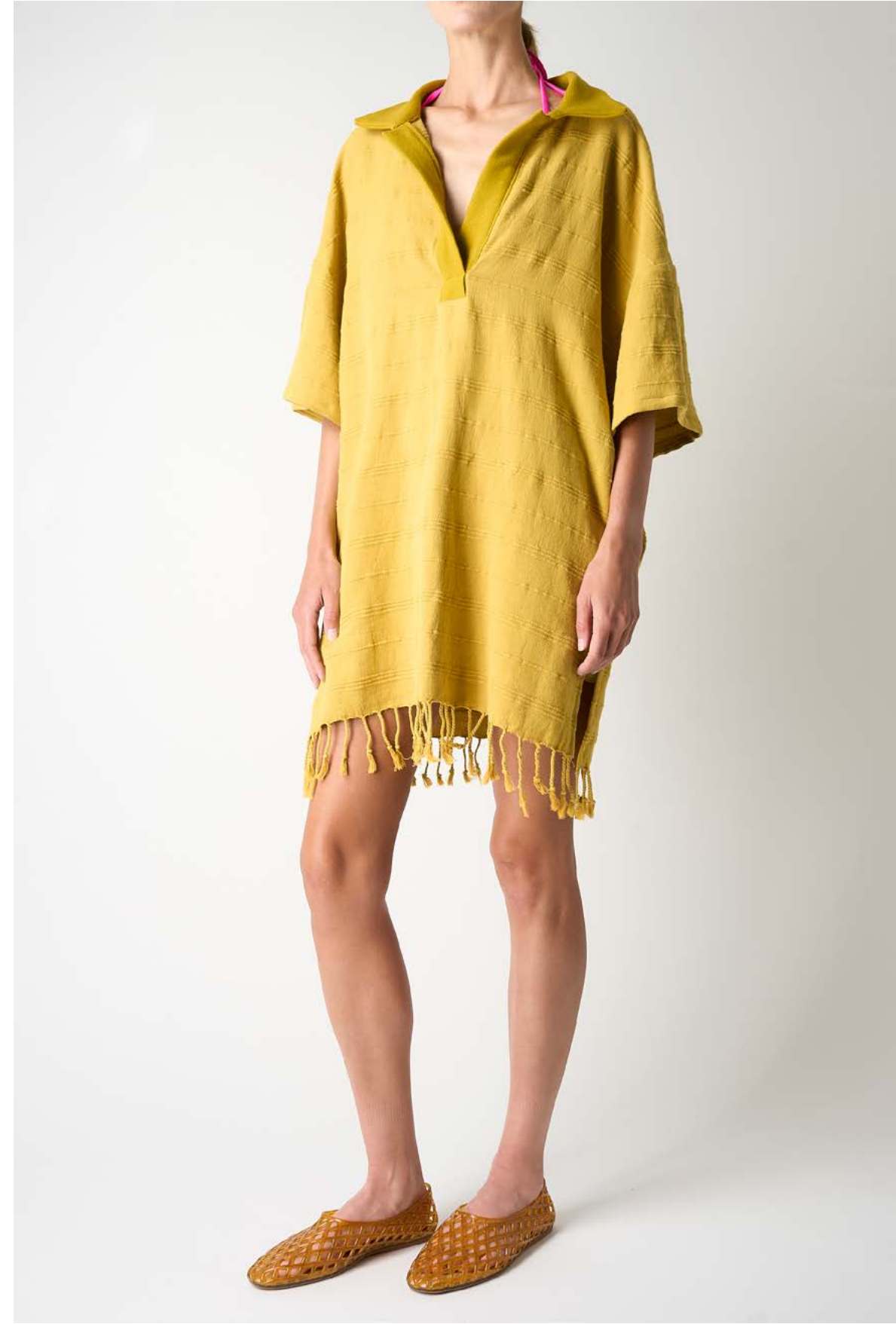
#2 RUGBY KAFTAN