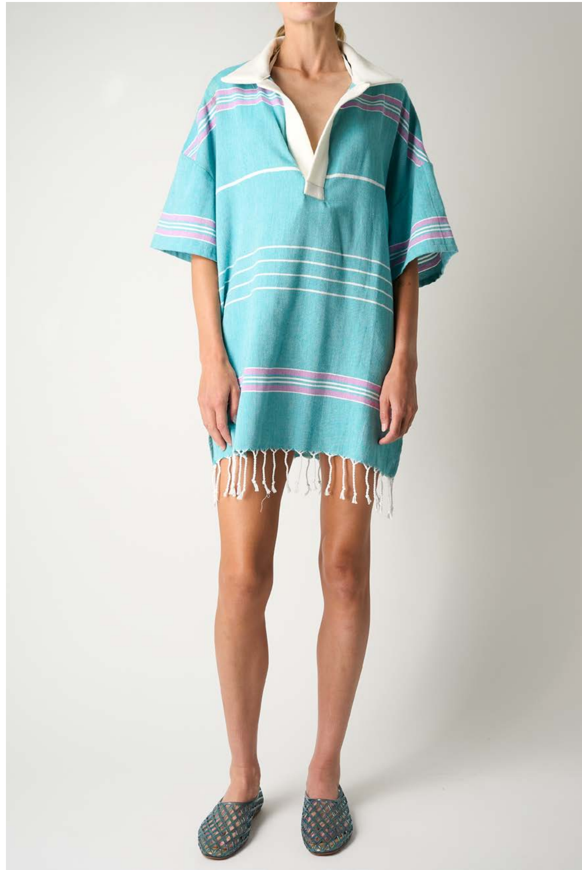
#19 RUGBY KAFTAN